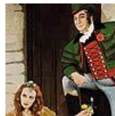
Mad Margaret and Sir Despard

It is a big jump to Sir Walter Scott, and 'Heart of Midlothian', one of his most popular Waverley novels. Straight from those pages comes now the volatile Madge Wildfire, whom Gilbert takes for his Mad Margaret. The stage directions require that she is dressed in 'picturesque tatters, and is an obvious caricature of theatrical madness'. She should be played, not as a raving lunatic, but as a person distraught: for so she will turn out to be, and in love with Sir Despard. But now we can hiss, because Despard comes on as 'the supreme caricature of the stage villain' and should be dressed accordingly. He and Margaret are out to kidnap Rose. The bridesmaids are horrified, and scatter theatrically at his appearance.