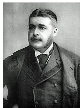
Sir Arthur Sullivan 1842-1900